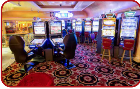
Casino Entrances & Lobby Area