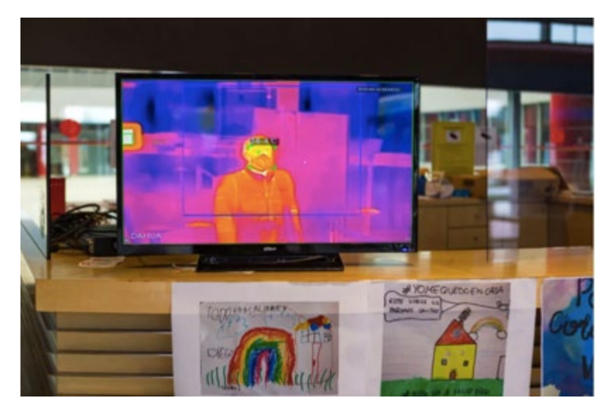
Figure 4 Thermal imaging in use at the entrance to a hospital in Spain.

Additionally, on March 17, 2020, the U.S. Equal Employment Opportunity Commission (EEOC) issued an update to its guidance indicating that employers may implement temperature-screening measures in response to the COVID-19 pandemic. The EEOC noted, "Because the CDC [Centers for Disease Control and Prevention] and state/local health authorities have acknowledged community spread of COVID-19 and issued attendant precautions, employers may measure employees' body temperature."