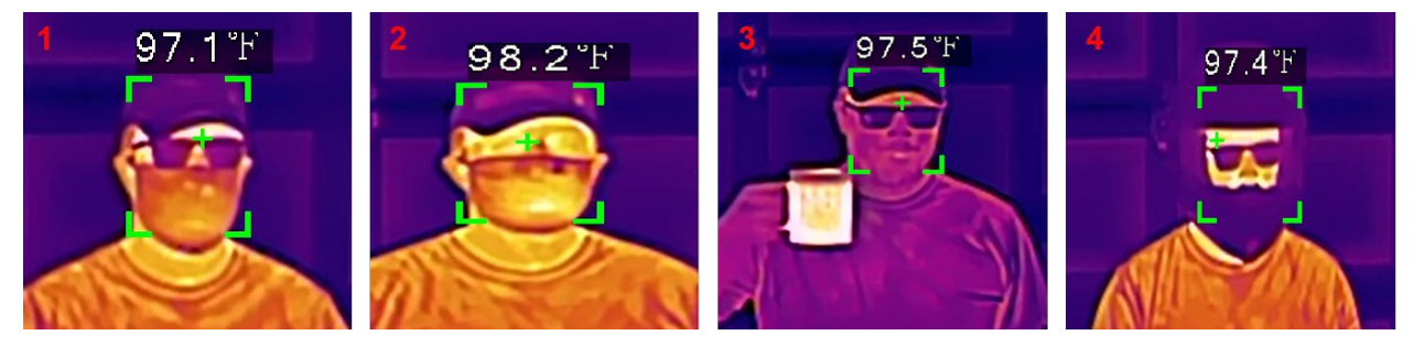
Figure 1: Thermal camera images showing facial temperature measurements

The images below are snapshots of actual thermal camera video that show human temperature measurements under these circumstances: 1) person wearing glasses and a mask, 2) person wearing a mask, 3) person holding a hot beverage, and 4) person wearing a helmet.