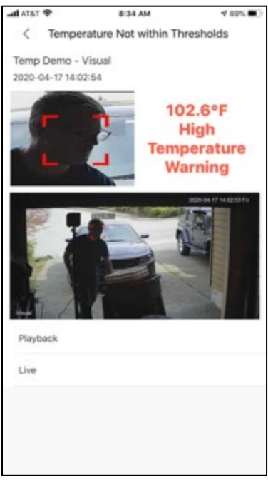
Figure 5: Sample alert of a person with an elevated skin temperature

The gaming and hospitality industry will also benefit from the deployment of thermal temperature monitoring devices at entrances / exits and throughout the facility. For a person with an elevated temperature, a visual alert is sent so that security personnel has a visual image of the person's identity and can re-check their temperature.